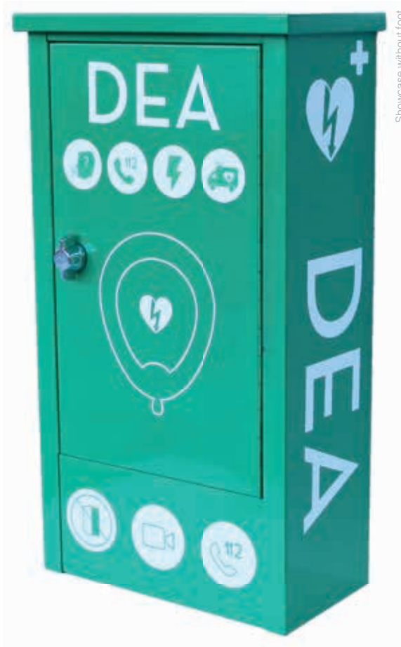
Showcase without foot