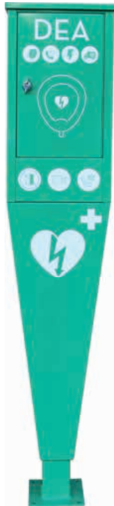
Showcase with foot